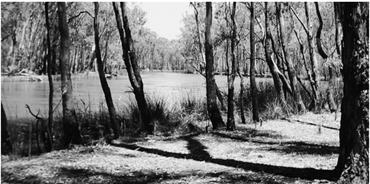
The Narrows or Barmah Choke on the Murray River between Picnic Point (near Mathoura) and Barmah. This is a recent section of the river, believed by some scientists to have been formed as recently as 550 years ago. Formed as silt jetties, the banks are straight-sided while the older sections of the river up- and downstream have the sloping banks typical of a mature stream. This is the first section of the local river to flood when high flows come down the Murray.