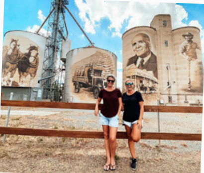
"Our home town of Melbourne is known for its vibrant art scene, but you can get your dose of it in Regional Victoria too... A perfect way to spend the day. There are some epic landscapes as you drive along the trail which starts from Benalla, about 200kms north of Melbourne"