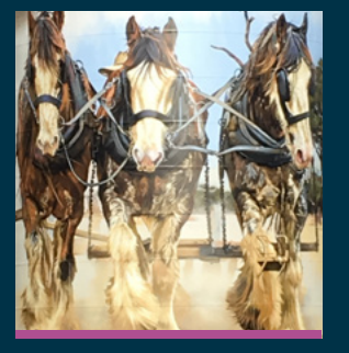
Goorambat by Jimmy D'Vate