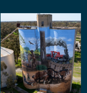
Katamatite