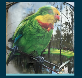
Devenish by Cam Scale